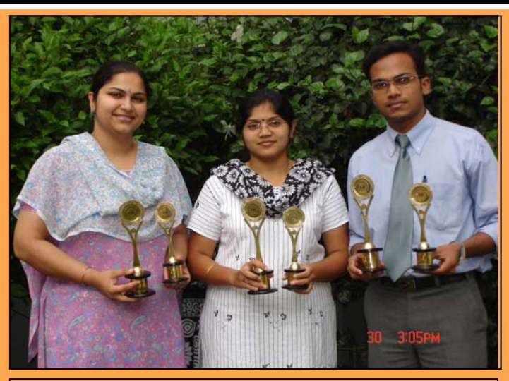
The XIME 'Dream Team' at CII Managemantra 2006

In the spot Business Quiz event, XIME Team swept all